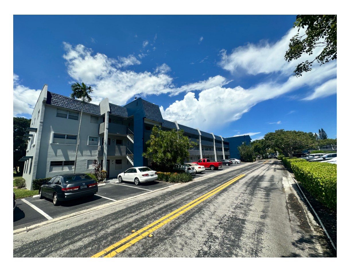
Oriole Golf & Tennis Club Condominium One Bldg. F (7827)

7827 Golf Circle Drive, Margate, FL 33063